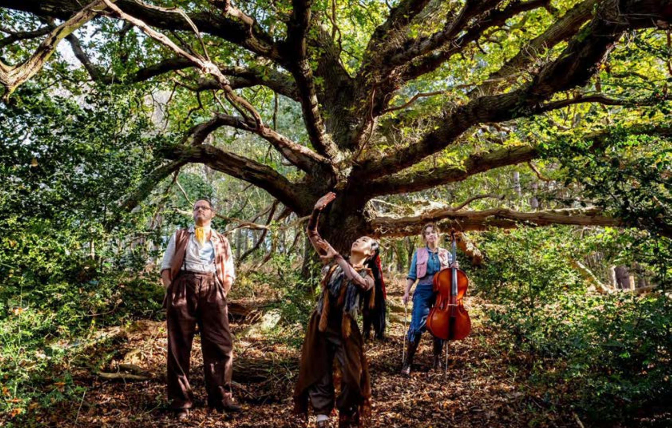
The Ancient Oak of Baldor—Visual Story